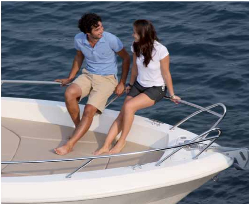
Panca con schienale STD da 10/2014 / Bench with backrest STD from Oct. 2014