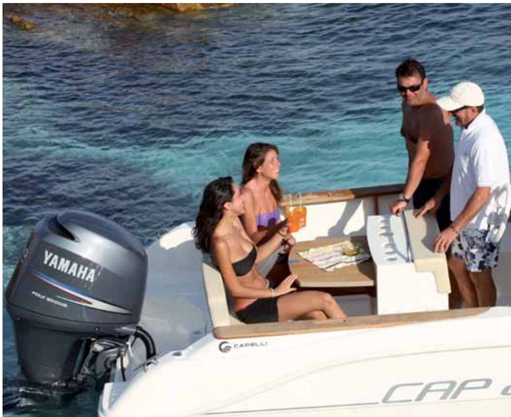
Panca comfort OPT da 10/2014 / Comfort bench OPT from Oct. 2014